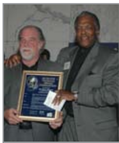
Gold Sponsor Mt. Royal Printing