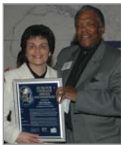
Silver Sponsor Stoy & Malone Co.

Bronze Sponsor - Service Master of Baltimore