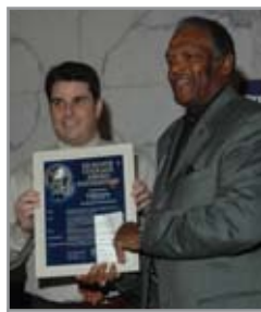
Platinum Sponsor CitiFinancial

The Ed Block Courage Award Foundation, Inc. recognizes the following sponsors for their ongoing commitment to providing financial support and in-kind services. Their involvement deserves the highest recognition. On behalf of the children and families who receive care through the Courage House National Support Network for Kids, we thank you for making this concept possible to help children in all NFL cities.